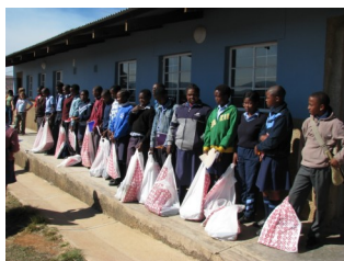
A Target bag full of school supplies for excellent student attendance

Donate here Or for more information go to www.generationjoy.org