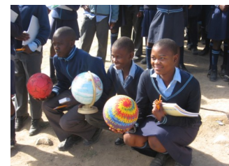
Generation Joy helps make the world go round