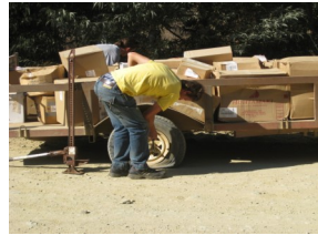
Flat tires all just a day in the life of a Gen Joy traveler