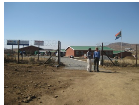
A new school just waiting for our pens ,pencils and paper!